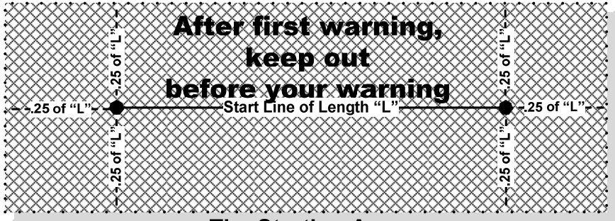
The Starting Area

After the first warning signal for a race and prior to her warning signal, a sailboat shall keep clear of the starting area that extends one-quarter of the length of the starting line ahead of and behind the starting line. It shall also extend one-quarter of the length of the starting line past either end of the starting line