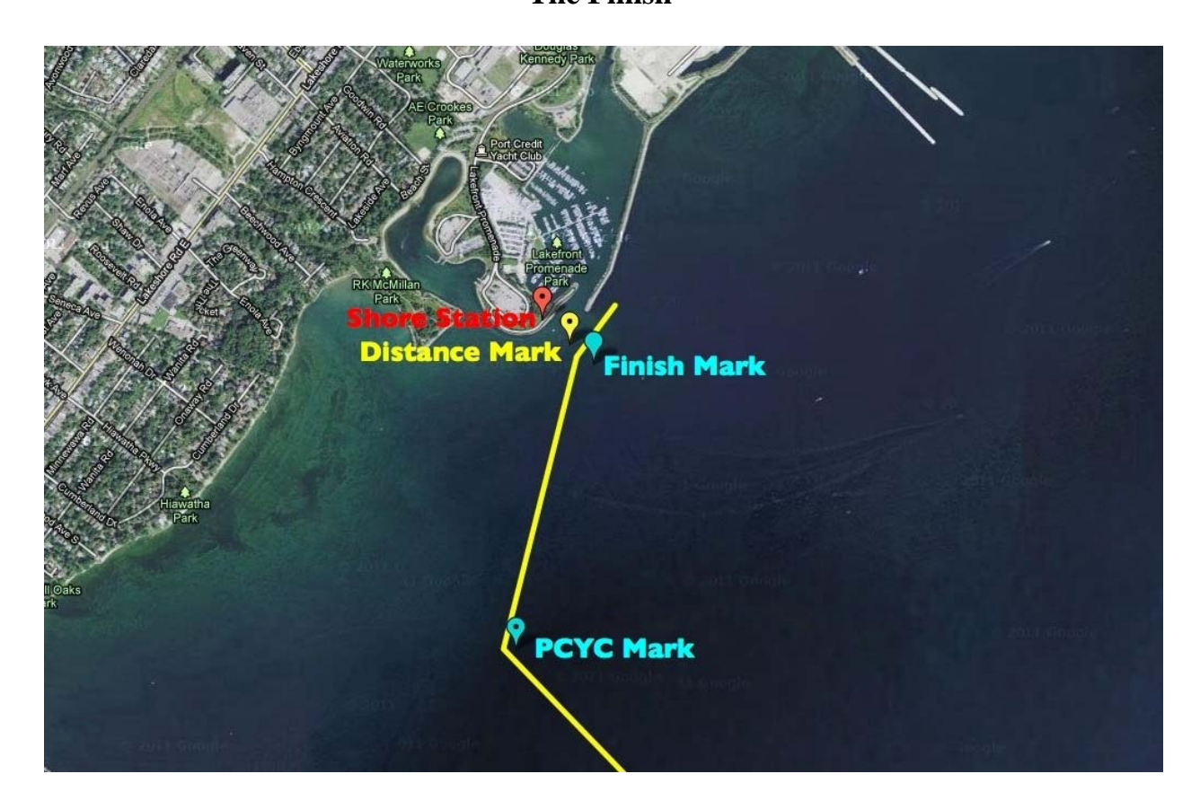
Diagram 2 The Finish

After the first warning signal for a race and prior to her warning signal, a sailboat shall keep clear of the starting area that extends one-quarter of the length of the starting line ahead of and behind the starting line. It shall also extend one-quarter of the length of the starting line past either end of the starting line